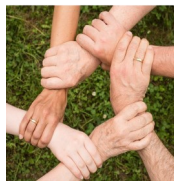
Committee Updates Page 2