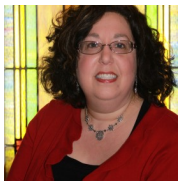
From the Pastor Page 1