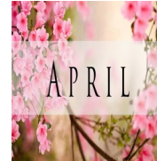
April Schedules Page 4