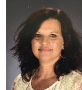
LCM Page 6