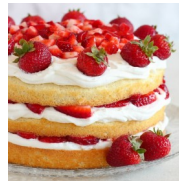
Birthdays/Anniversaries Page 4