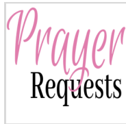
Prayer Requests Page 3