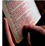
Daily Bible Reading Page 3