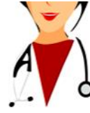
Take Care Page 4