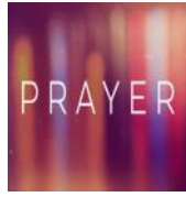
Prayer Requests Page 3