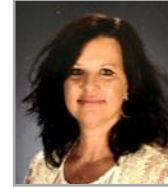
LCM Page 5