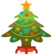
Celebrations Page 2