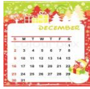
Church Calendar Daily Bible Reading Page 2