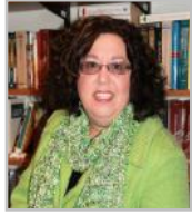
From the Pastor Page 1