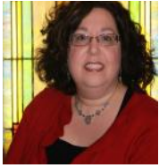
From the Pastor Page 1