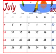
Church Calendar Page 4