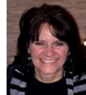
Take Care Page 5