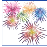
Birthdays/Anniversaries Page 4