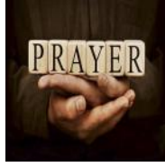
Prayer Requests Page 3