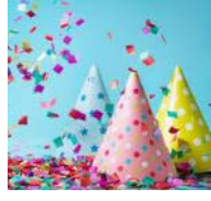
Birthdays/Anniversaries Page 4