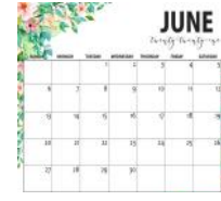
Church Calendar Page 4