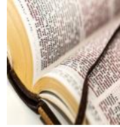
Daily Bible Reading Page 4