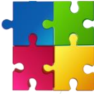
News & Updates Page 2