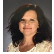
LCM Page 5