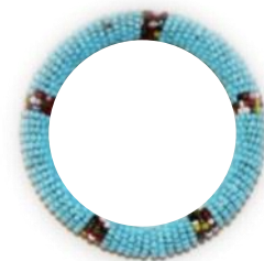
Handmade Maasai Bracelet

Handicrafts, including beautiful jewelry, (many made by the Maasai tribe) will be available. Stop by the Café area to view and purchase the items.