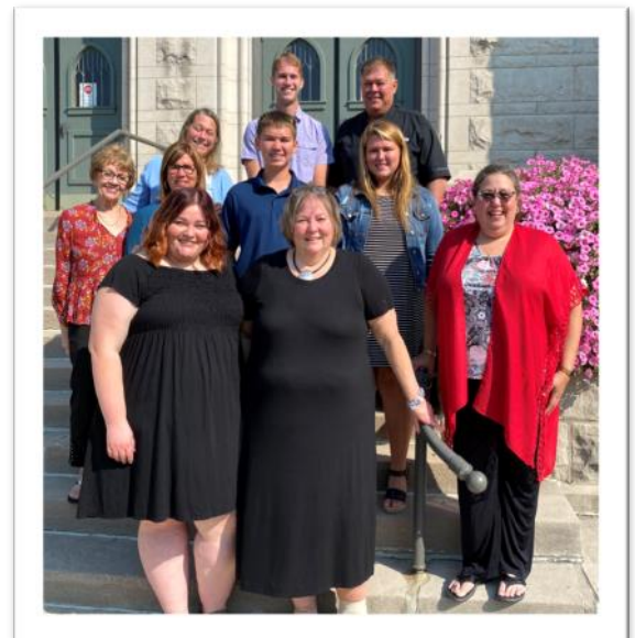
2020 Confirmation Class